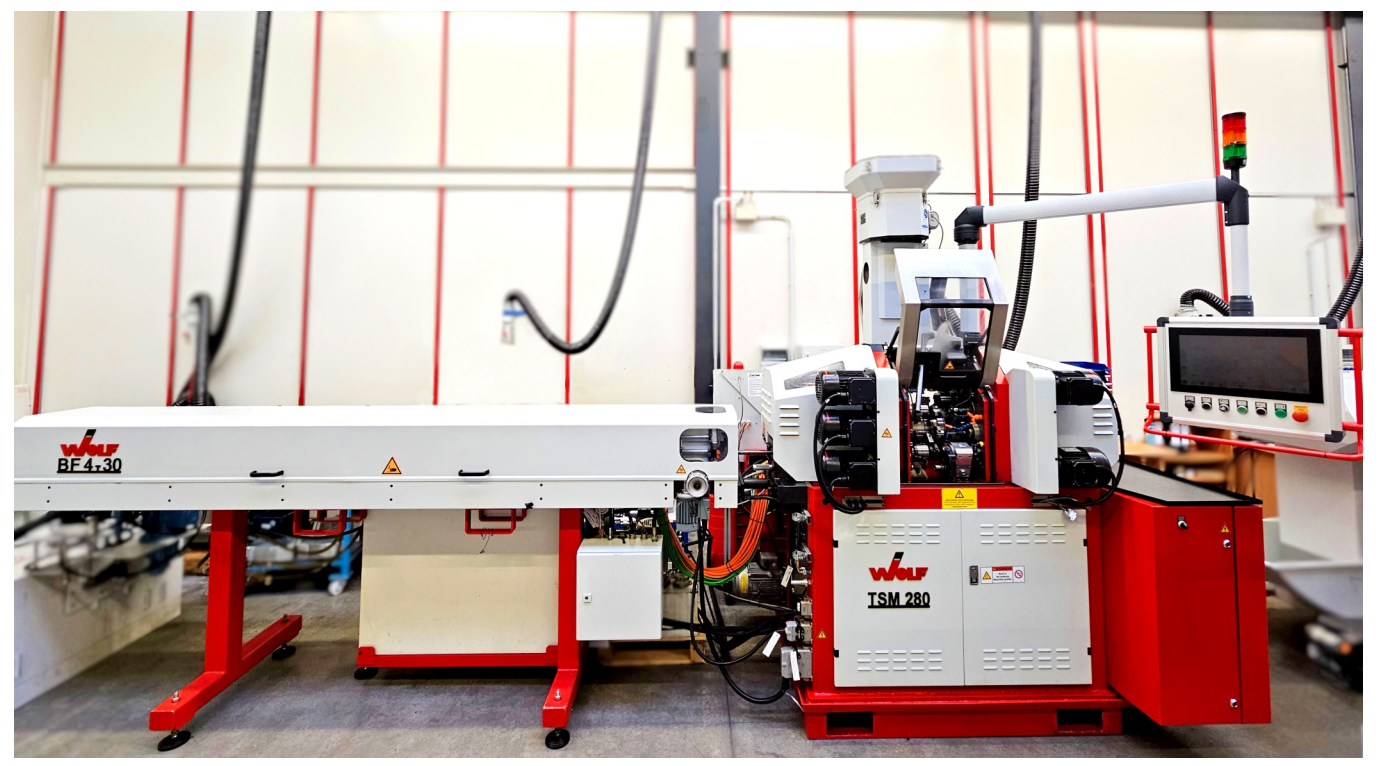
Contact us for further information about the machine.